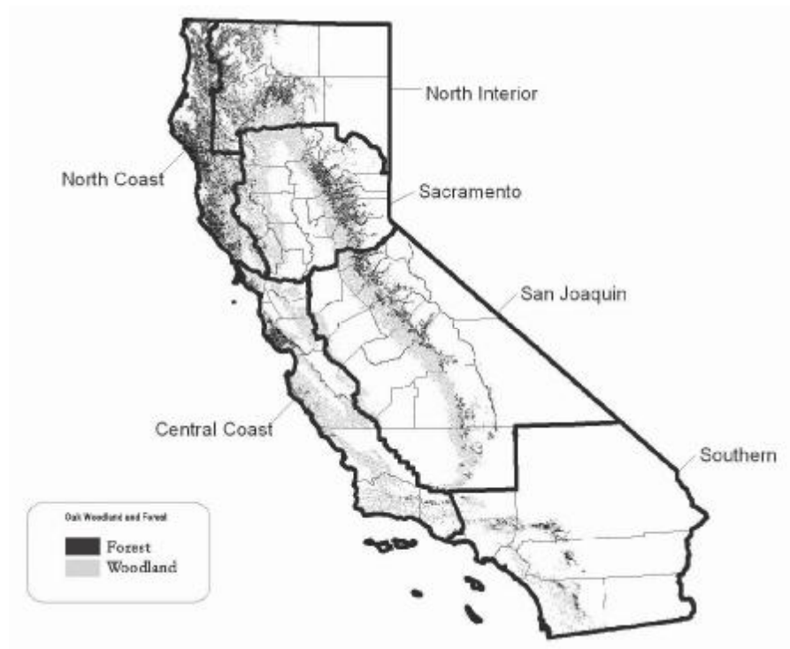
Figure 1 – This map shows the distribution of oak woodlands and oak forests by county and by region.

Policymakers recognize that oak woodlands and forests sequester and store atmospheric carbon in quantities that contribute to the health and well-being of Californians. Oaks 2040 identified almost 13 million acres (over five million hectares) of oak woodlands and forests in California. See Figure 1. Due to their scenic, wildlife habitat, biodiversity, and cultural values, these oak-related lands have sequestered over 325 million metric tons of carbon in live trees. Another 350 million metric tons of carbon are sequestered in understory vegetation, downed woody material, and soil horizons. This research project quantifies these carbon assets and evaluates their future ability to sequester additional carbon. Oak sequestration by oak type is provided for each California oak county.