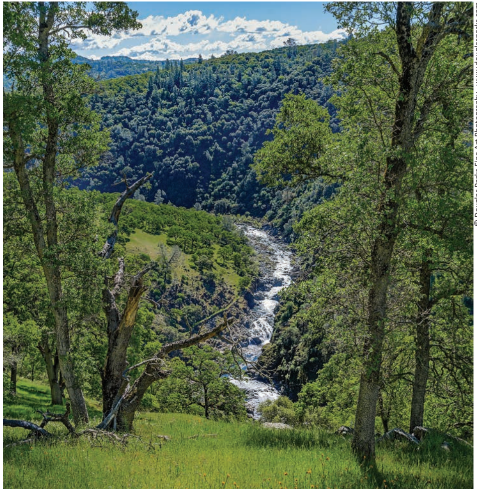
Cosumnes River Canyon

A protected future for this landscape was not always assured. In the 1950s the Bureau of Reclamation proposed the Nashville Project, a three-dam complex immediately east of Highway 49 on the Cosumnes River. But the Cosumnes is not a high-elevation watershed, and as such, a hydroelectric complex on the river would have limited capacity. Thus the proposal died with more intensive financial analysis. In the mid-1990s, McCuen Properties proposed a subdivision of 569 rural lots over the 7,800 acre ranch. This project was