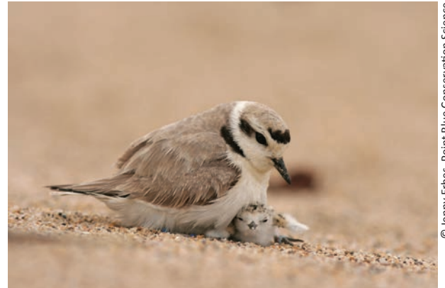
Western snowy plover ( Charadrius nivosus nivosus ) and chick

Don Edwards marshes provide habitat for two federally-listed endangered species, Ridgway's Rail ( Rallus obsoletus obsoletus ) and salt marsh harvest mouse ( Reithrodontomys raviventris ). Former salt pond levees, open ponds and dry pan have also become important habitat for shorebirds and waterfowl crowded out of other areas by development, including the western sandpiper ( Calidris mauri ) and the threatened western snowy plover ( Charadrius